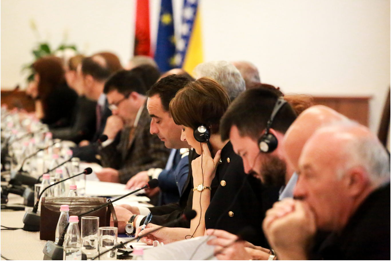
The programme of the seminar can be found here \underline{e\text{-ppsd18}\_4\text{-joint-parliamentary-seminar-on-misuse-of-administrative-resources\_tirana\_april-2018\_v22-1-}