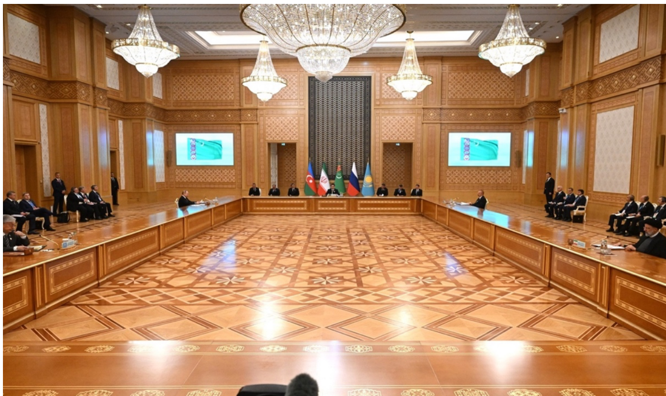
Vladimir Putin (far left) at 6 th Caspian Summit in Ashkhabad (29 June,)