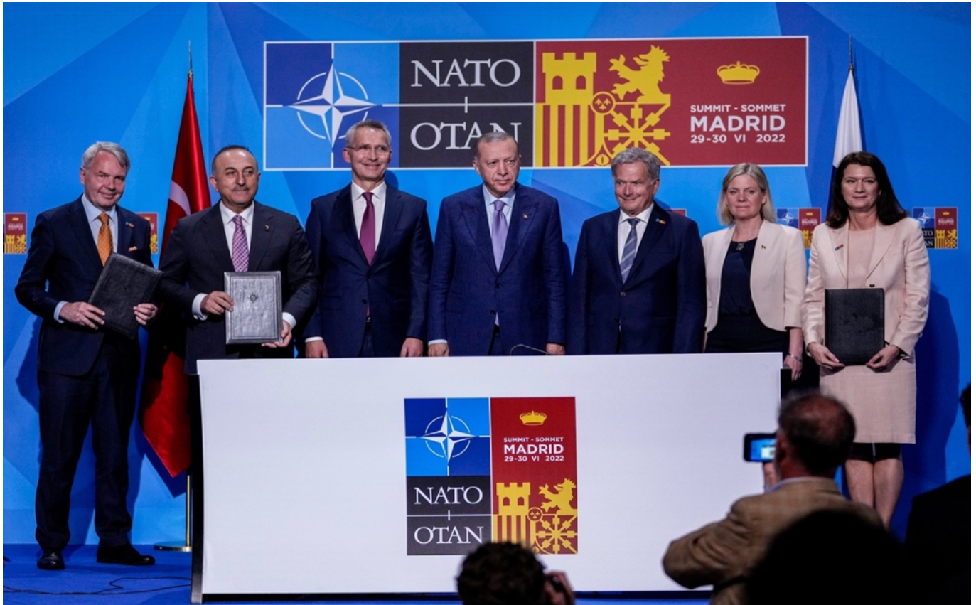
From left to right background: Finnish Foreign Minister Pekka Haavisto, Turkish Foreign Minister Mevlut Cavusoglu, NATO Secretary General Jens Stoltenberg, Turkish President Recep Tayyip Erdogan, Finland's President Sauli Niinisto, Sweden's Prime Minister Magdalena Andersson, and Sweden's Foreign Minister Ann Linde pose for a picture after signing a memorandum in which Turkey agrees to Finland and Sweden's membership of the defense alliance in Madrid, Spain, on 28 June