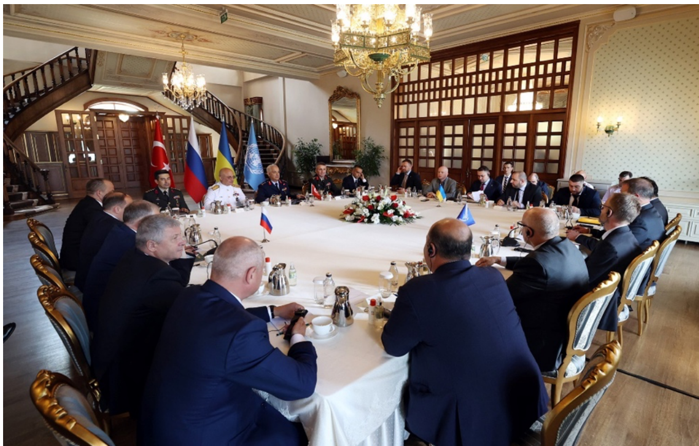
Military delegations from Turkey, Russia, and Ukraine, along with U.N. officials, attend a meeting to discuss the shipment of Ukrainian grain stuck due to the blockade of Black Sea ports, Turkey, 13 July.